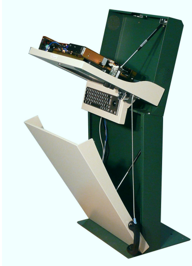
easy access from front

The forward-opening doors present components to the maintenance technician for very easy access. The kiosk can be bolted securely to the floor, and there is no need to move the kiosk away from walls, or dismantle the main body of the kiosk to remove components for servicing.