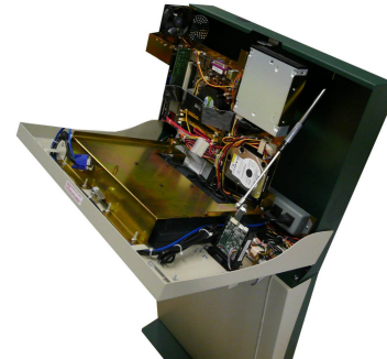
Computer components mounted on a hinged bracket for easy access