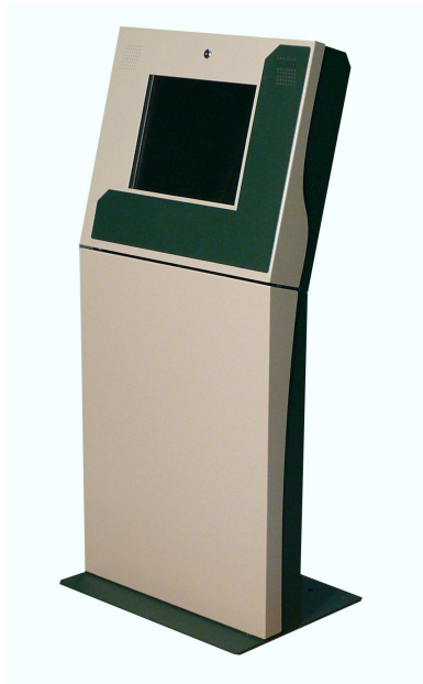
Configure with or without a wide range of peripherals