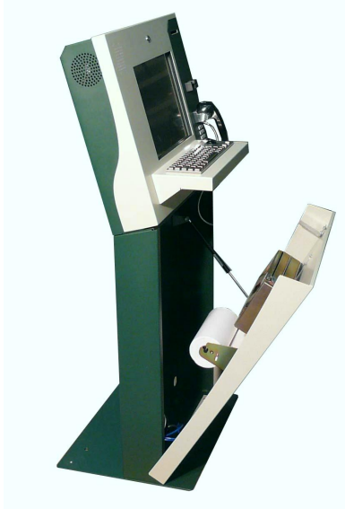
Easy Maintenance of Bottom Components